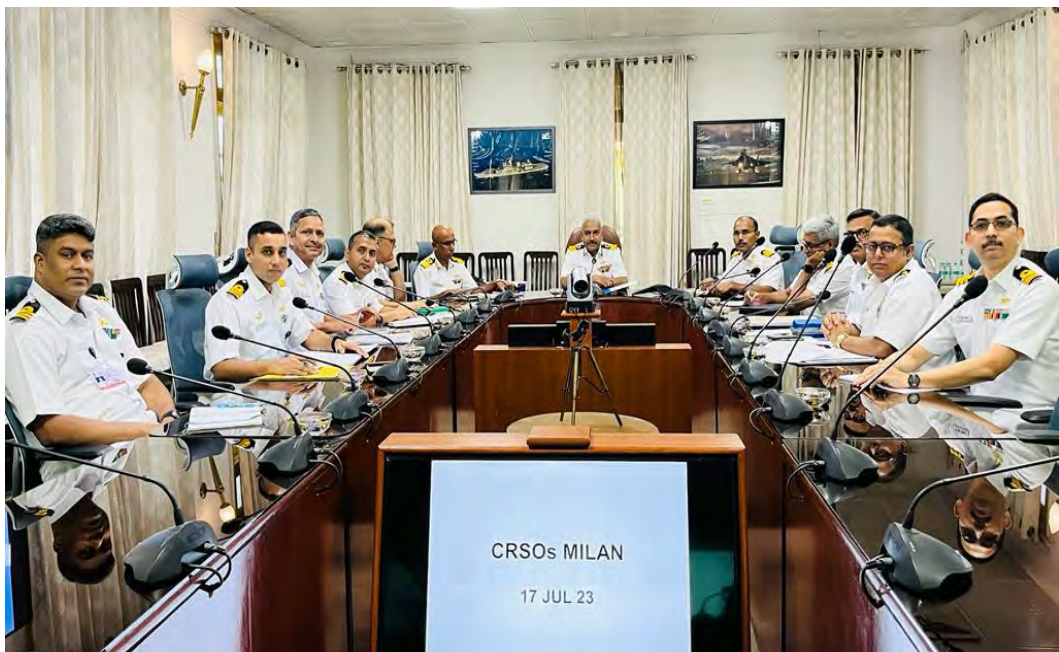
CRSOs Milan at New Delhi on 17 Jul 23