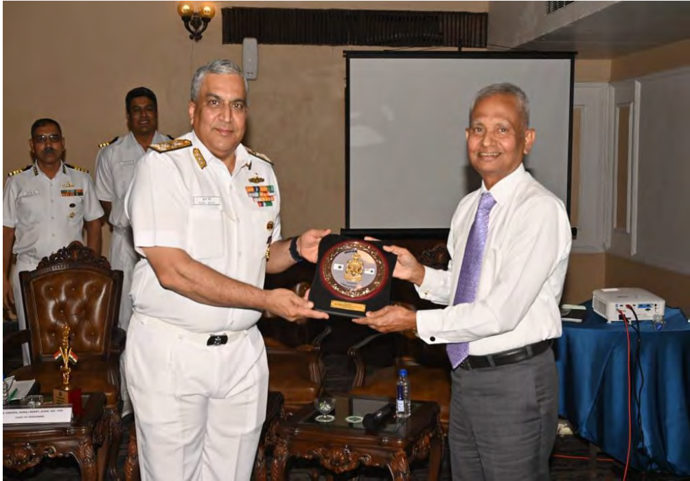
COP's Interaction with Veterans at Bhubaneswar, Odisha on 06 Aug 23