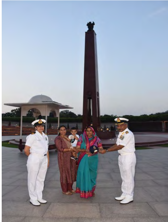
Wreath Laying Ceremony held at National War Memorial on 01 Aug 23