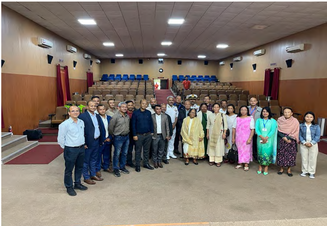
Outreach by IN Officials from DESA & CRSO (NE) held at Shillong, Meghalaya from 08 – 10 Aug 23