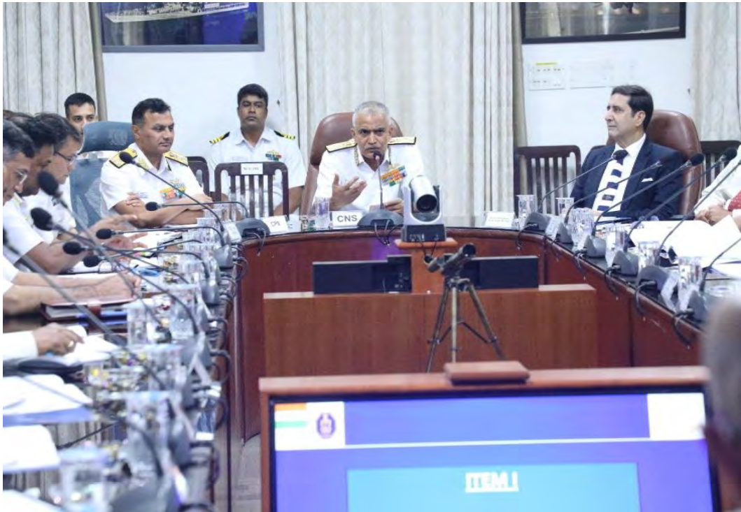
30 th AGM/ GCM of Navy Foundation held at New Delhi on 18 Jun 23