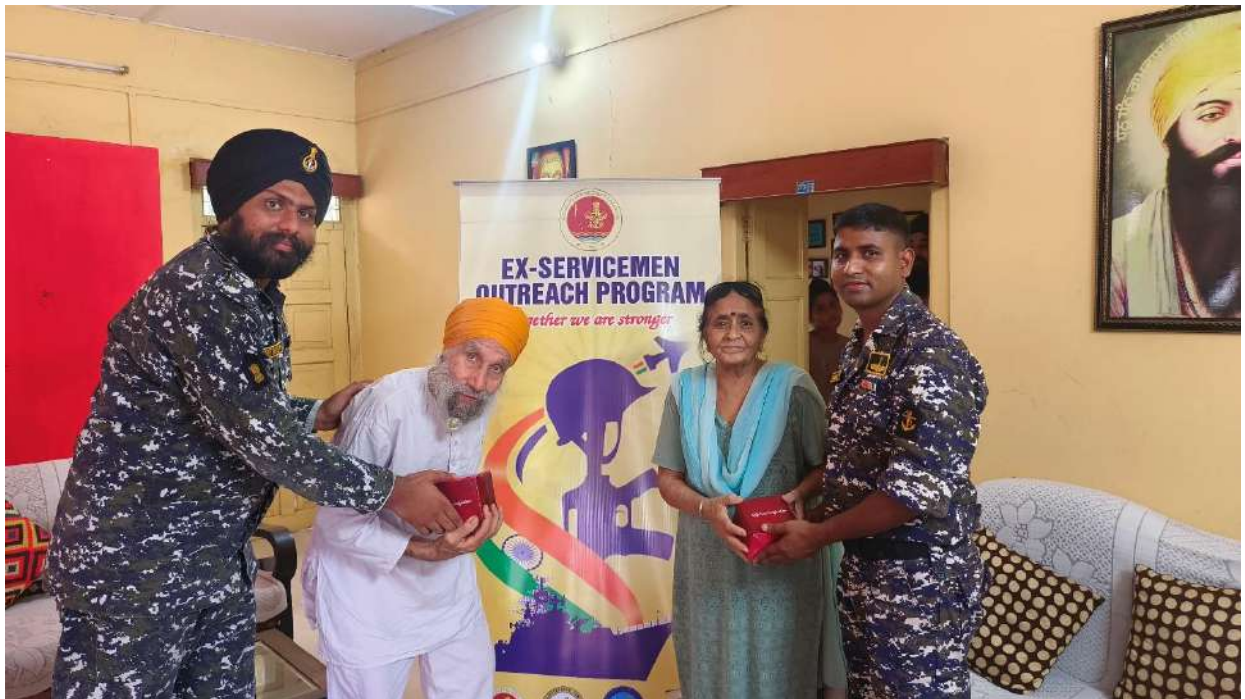
Felicitation of Veterans on 10 May 24 at Port Blair