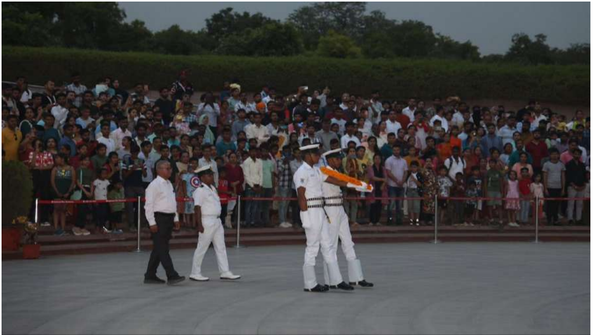
Wreath Laying Ceremony at National War Memorial (01 st of every month)