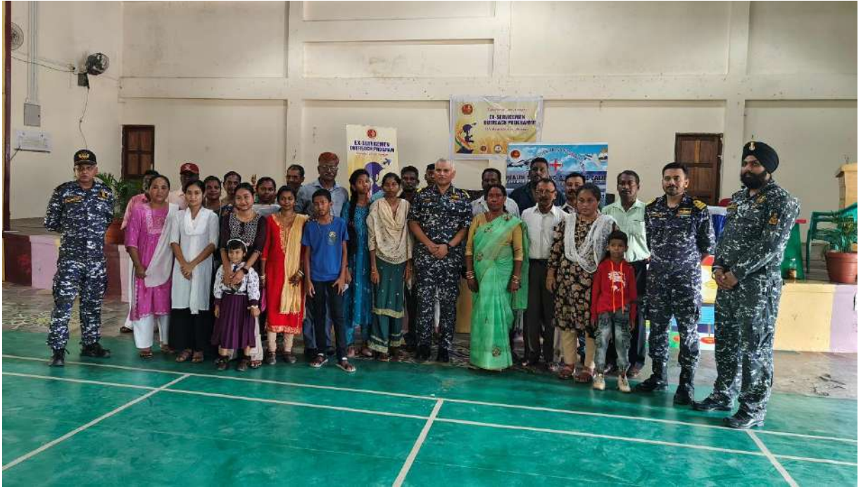
Interaction with Veterans on 10 May 24 at Port Blair