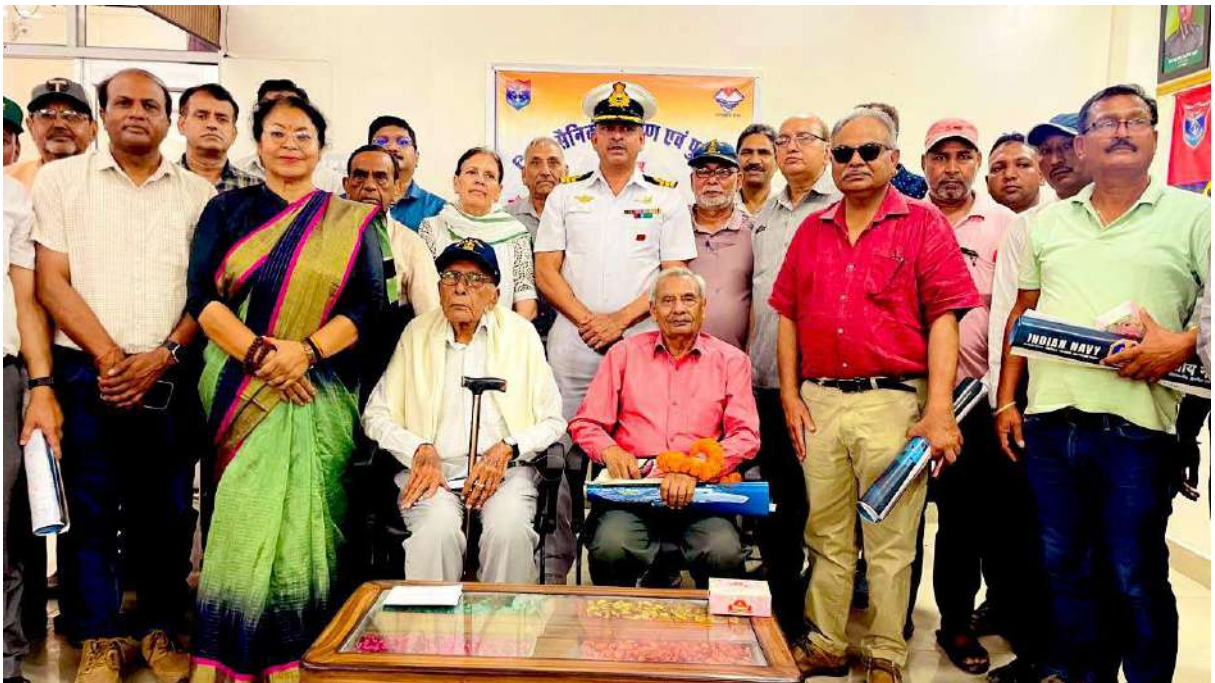
Outreach Programme by CRSO (North) on 29 May 24 at Haridwar