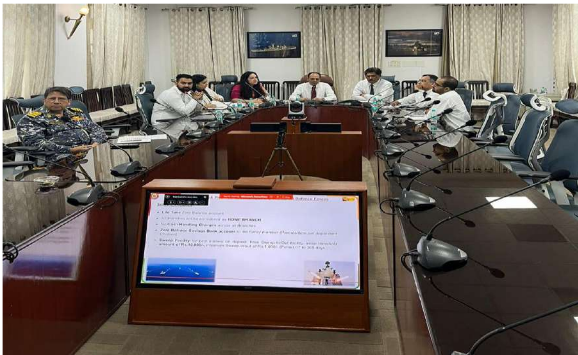
Pre-Retirement Capsule for Retiring Officers from 19 - 21 Jun 24 at New Delhi