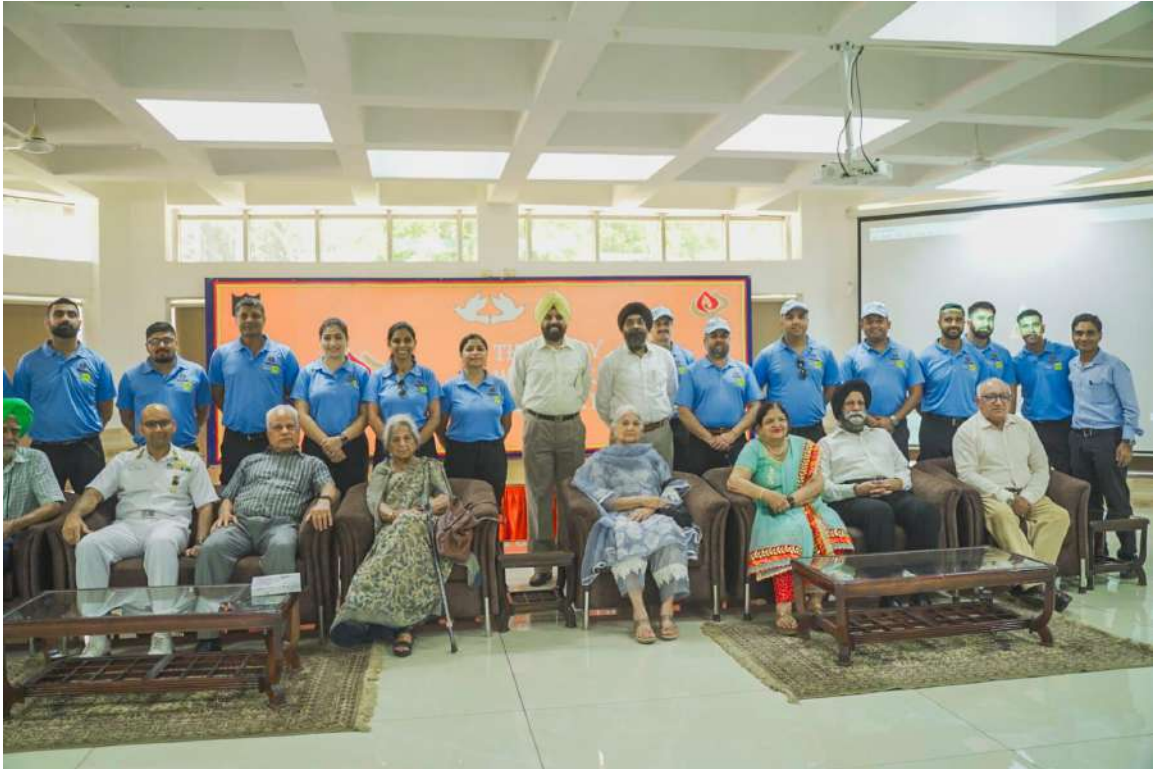
Sindhu Sikhar Car Rally - Interaction with Veterans on 11 Jun 24 at Chandigarh