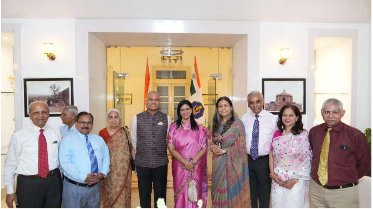
Interaction with Veterans on 20 Apr 24 at New Delhi