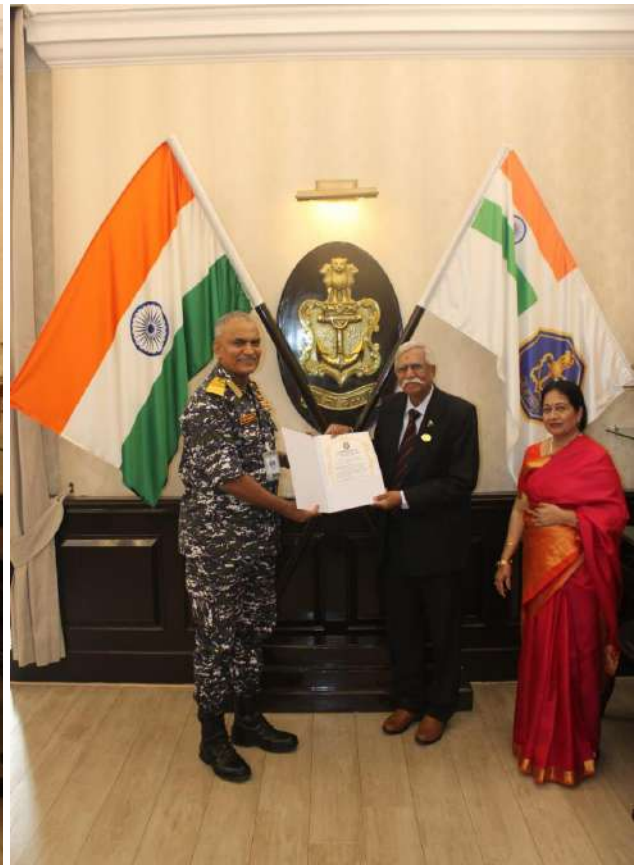
Felicitation of Retired Officers on 12 Apr 24 at New Delhi