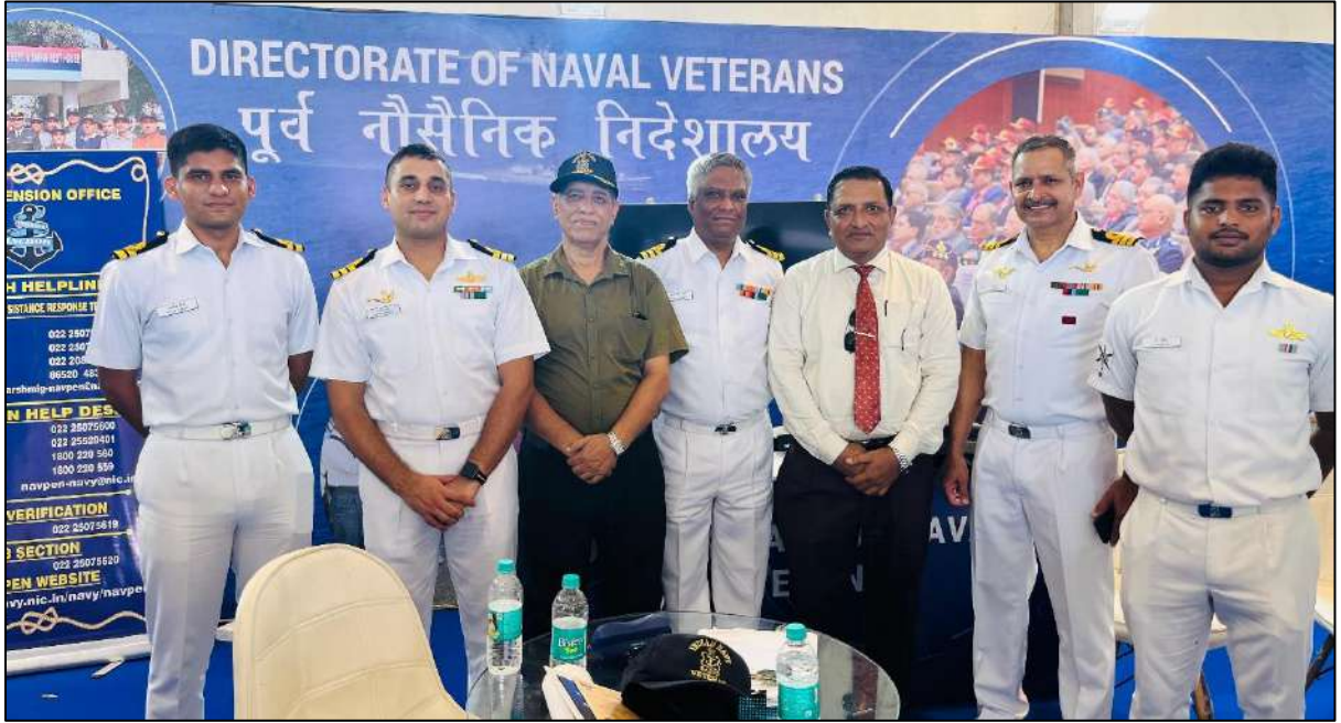
Interaction with Veterans at the DNV Stall in JCC from 03 - 05 Sep at Lucknow