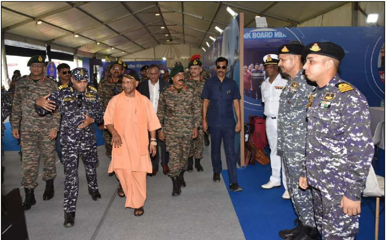
Visit of Hon'ble Chief Minister of Uttar Pradesh in Armed Forces Festival (Joint Commanders' Conference) on 03 Sep 24 at Lucknow