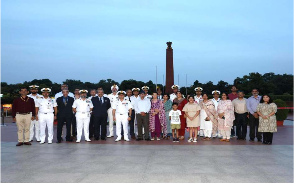
Wreath Laying Ceremony at National War Memorial (01 st of every month)