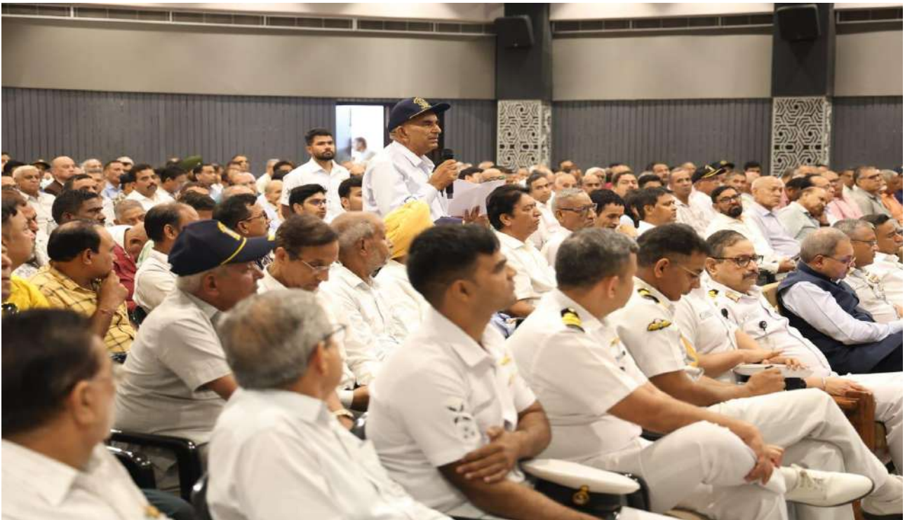
VSF North Zone AGM on 21 Jul 24 at New Delhi