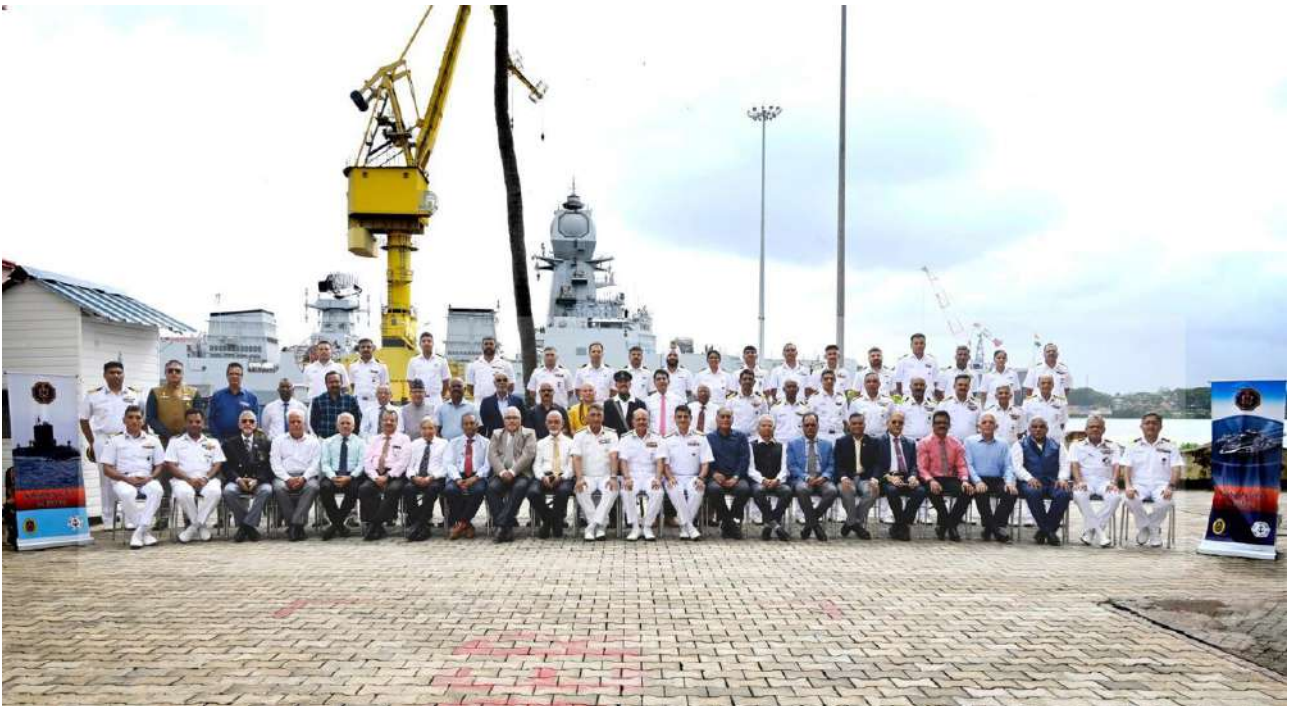
14 th GCM/ AGM of VSF and Samanvay on 05 - 06 Sep 24 at Kochi