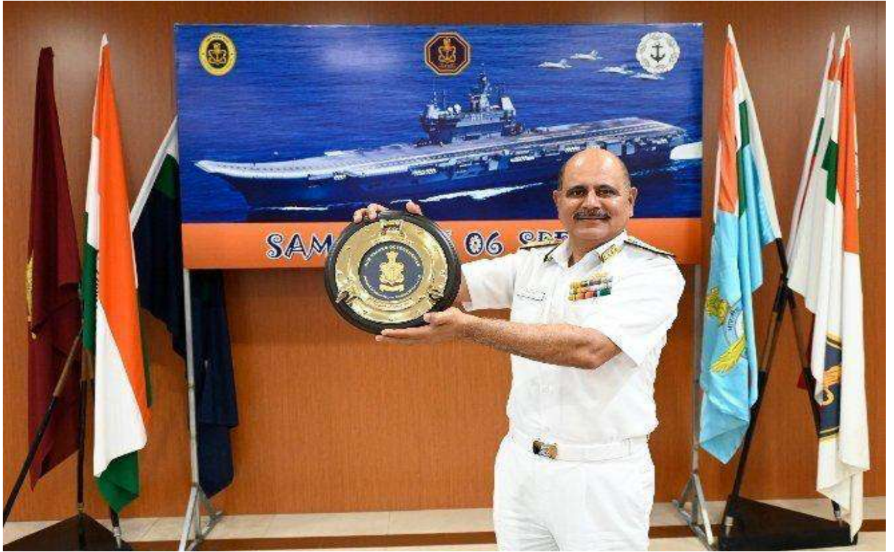
Unveiling of New Octogenarian Memento by CPS on 06 Sep 24 at Kochi